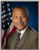
MAJ. GEN. CHARLES BOLDEN (USMC Ret.) Former NASA ADMINISTRATOR